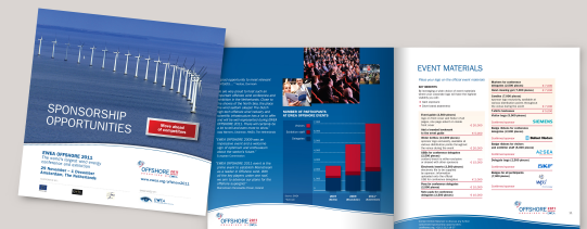
Top: New design for the Event Guide EWEA 2012 Annual Event) Middle: Conference session at EWEA events Bottom: Refreshed sponsorship brochure EWEA OFFSHORE 2011