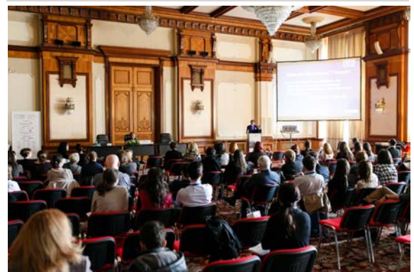
Top: Plenary session WPA 2013 Bucharest Congress